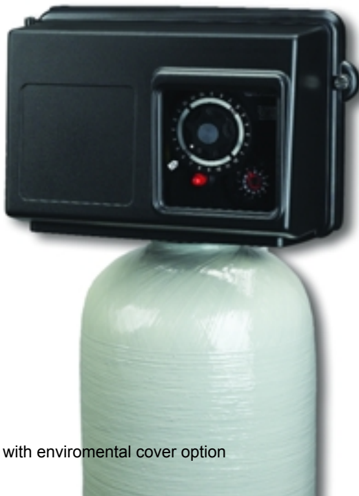
shown with enviromental cover option